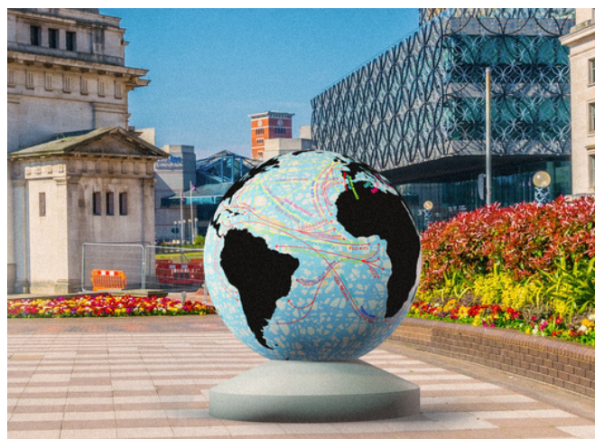
'The World Reimagined', 2021, Founding Artist Yinka Shonibare CBE

Submitted designs will be considered by the Open Call Jury.