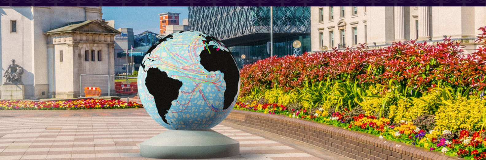
'The World Reimagined', 2021, Yinka Shonibare CBE.

Supported using public funding by ARTS COUNCIL ENGLAND